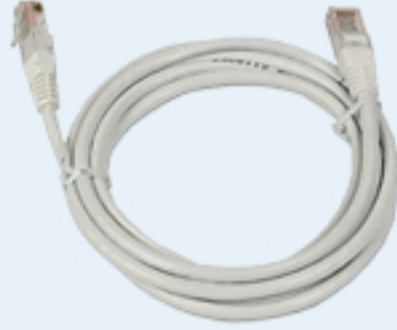
1x NETWORK CABLE