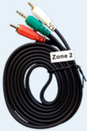
1x AUDIO CABLE