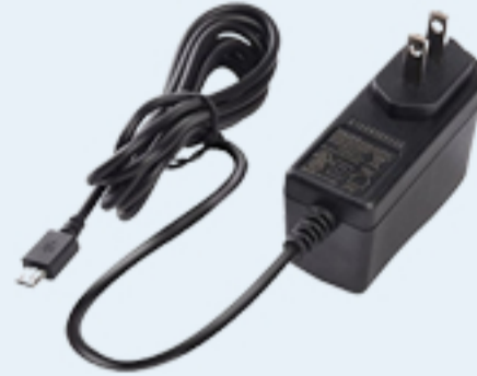
1x POWER CABLE